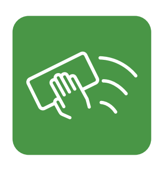
No. of Cleanings 600 times