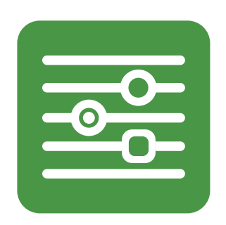
Connector Type/FC/SC /ST/LC/MU/D4/MPO